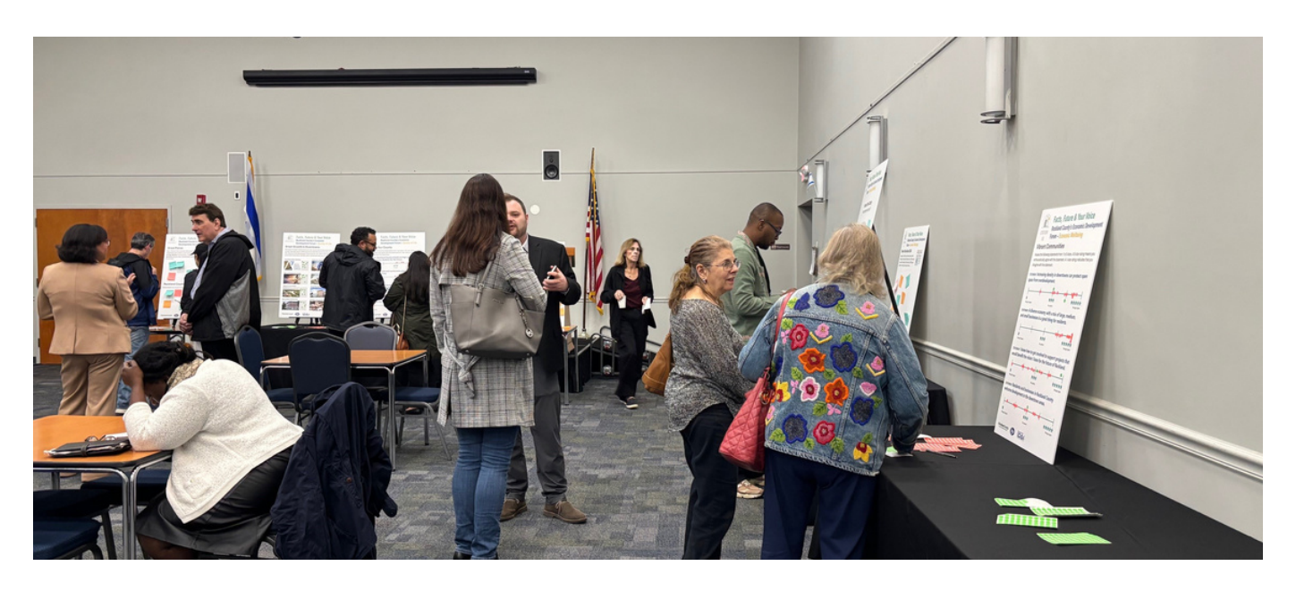
Rockland residents engage in discussions about Housing, Economic Wellbeing, and Quality of Life