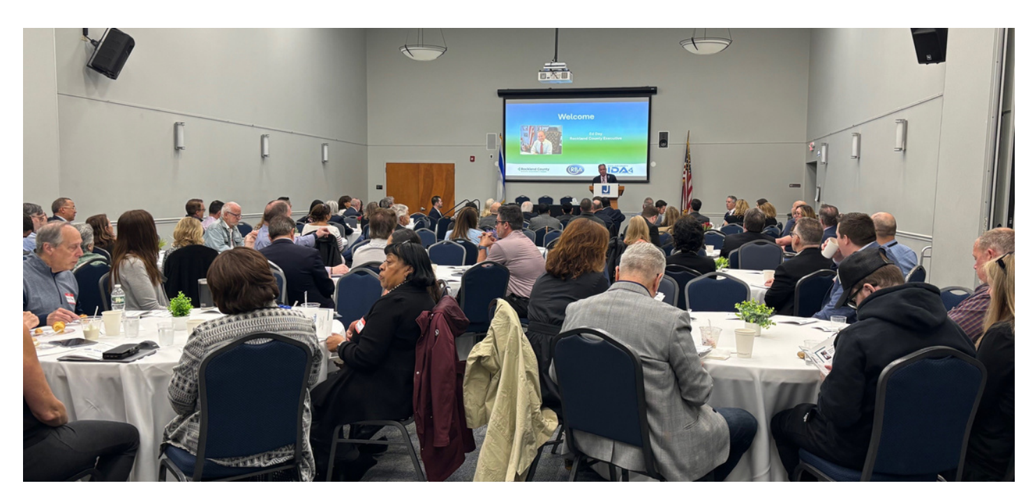
County Executive Ed Day welcomes attendees at Economic Development Forum